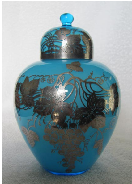
Regent Line blue ginger jar with Silver Overlay - ($375)