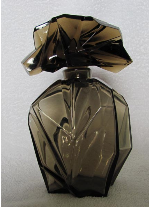
Ruba Rombic Smoky Topaz cologne bottle ($500)