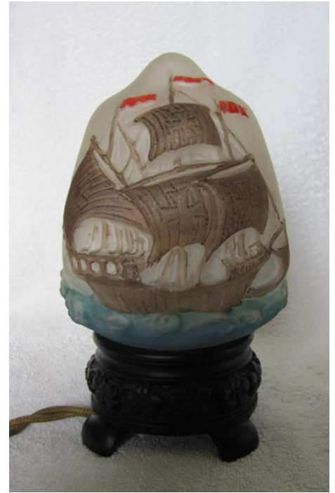
Santa Maria night light - ($500)