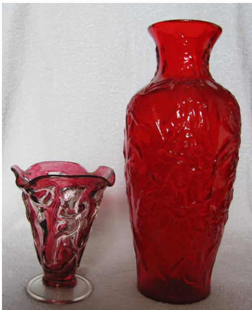
Dancing Nudes tumbler vase ($290) , red Foxglove ($300)