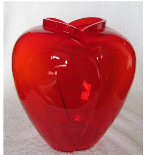
Kopp glass red "Heart" vase? ($65)